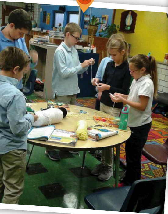
Fifth grade students learning about Sacramentals, and making a God's eye.