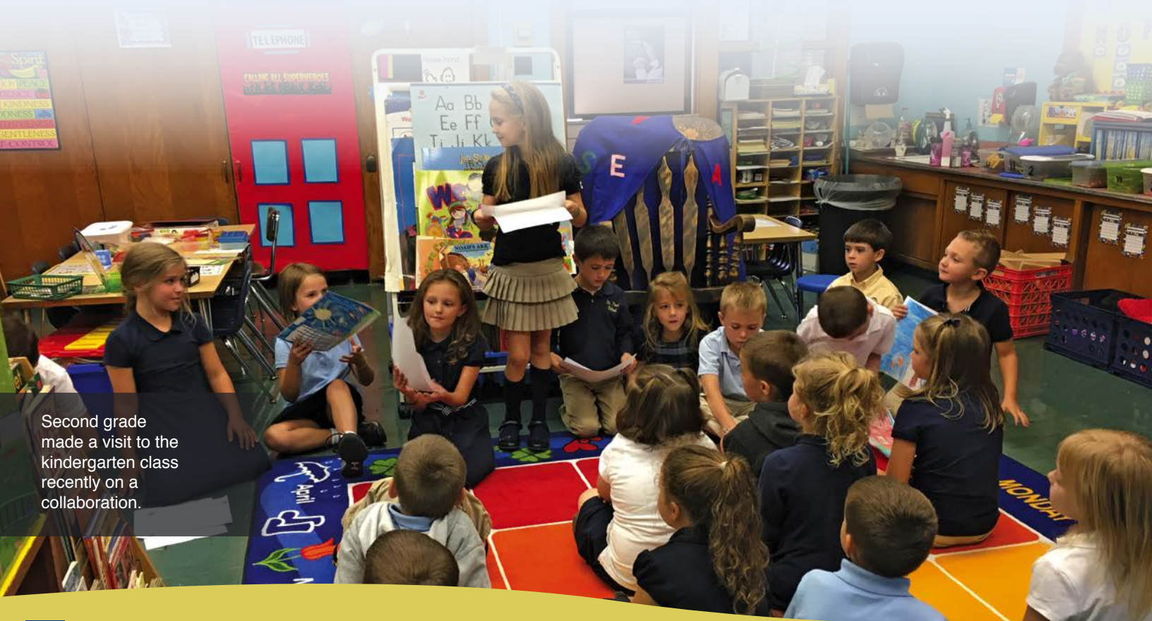
Second grade made a visit to the kindergarten class recently on a collaboration.