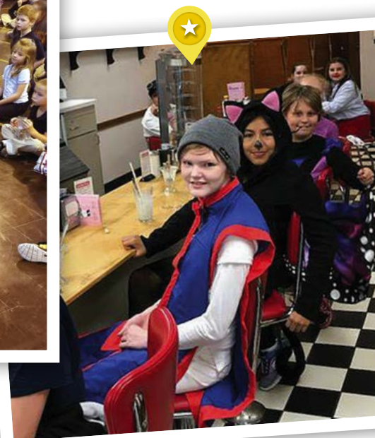
Students from grades six, seven and eight went back out to the Salem community in their Halloween costumes to businesses that partnered up to collect toiletries that the students will distribute here in Salem.