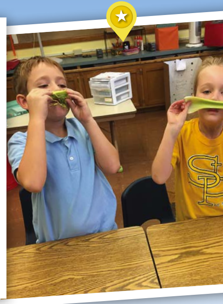
First graders observed celery using their five senses.