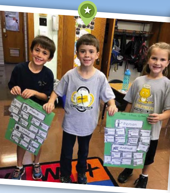
Person? Place? Thing? or Animal? Second graders collaborated on sorting and determining nouns in small groups.