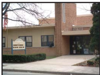
Saint Paul School