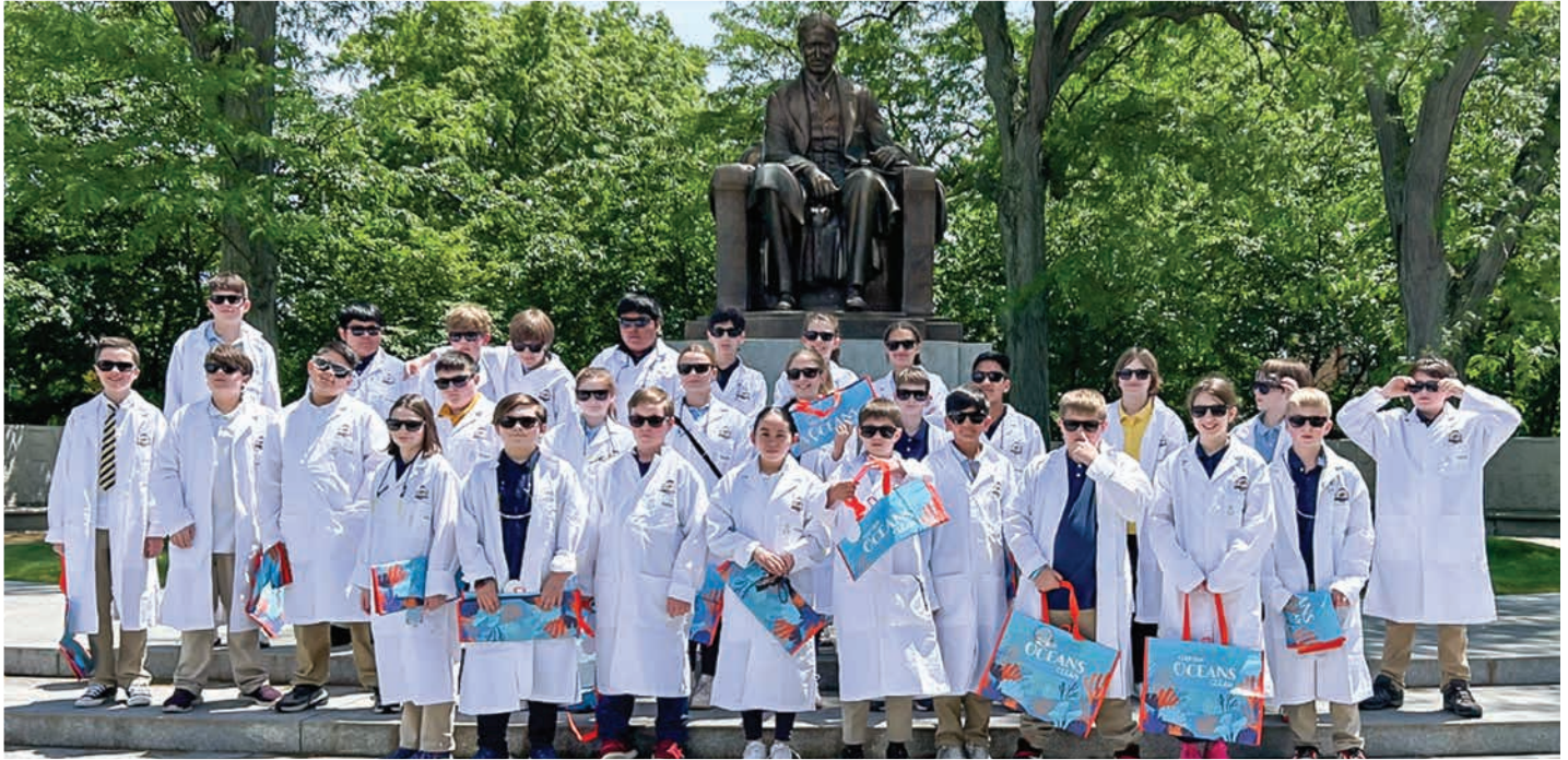
St. Paul School was awarded at 2023-2024 Ohio Governor's Edison Award for Excellence in STEM education and research. Here students gather outside of the Bridgestone ATC headquarters in Akron after serving as "Engineers for a Day."

new student tables that provide additional seating, ergonomics, and safety. The building WiFi was upgraded. Our preschool was furnished with new tables and cubbies, making the space functional and welcoming. Grades 4-8 received new seating and tables. Grade 2 received additional book and technology furnishings. All rooms now have "smart" collaboration displays and new Chromebooks. We were able to procure 410 new folding chairs and 27 tables for events in Scullion Hall, as well as portable choir