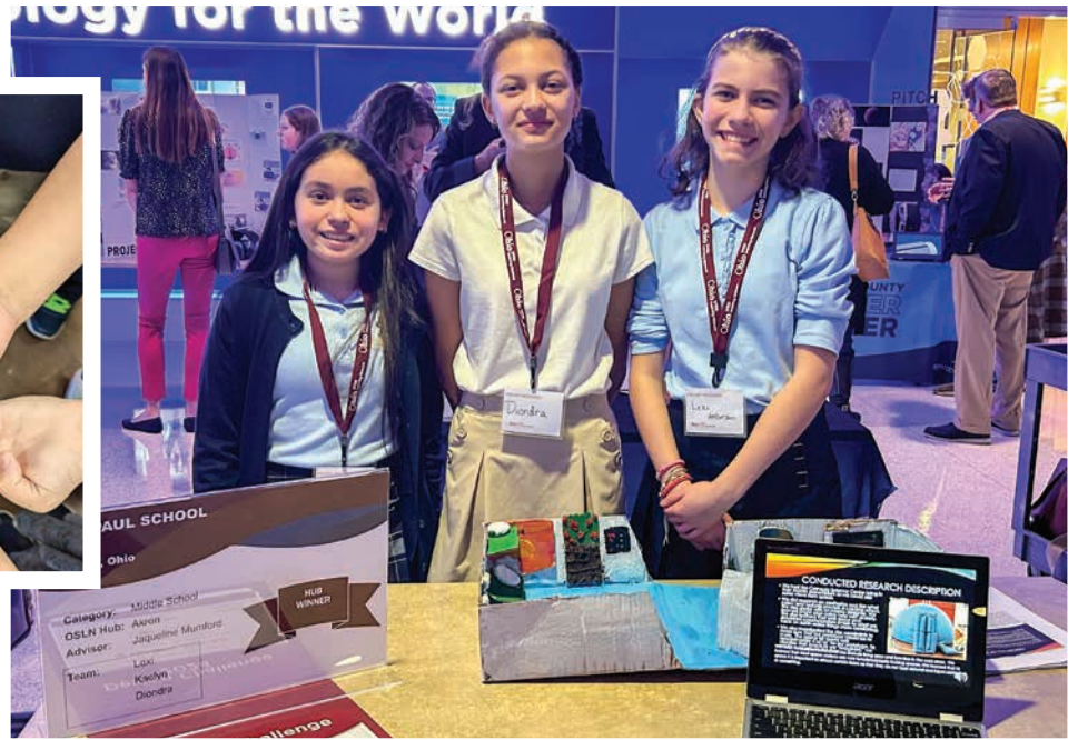
St. Paul School had 7 finalists in the 2023-2024 OSLN STEM Design Contest finals at Battelle headquarters in Columbus.

We are also excited to announce that in addition to the generous