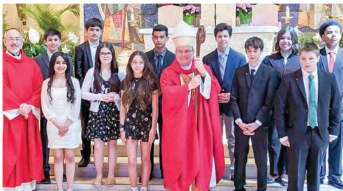
The St. Paul confirmation class of 2024