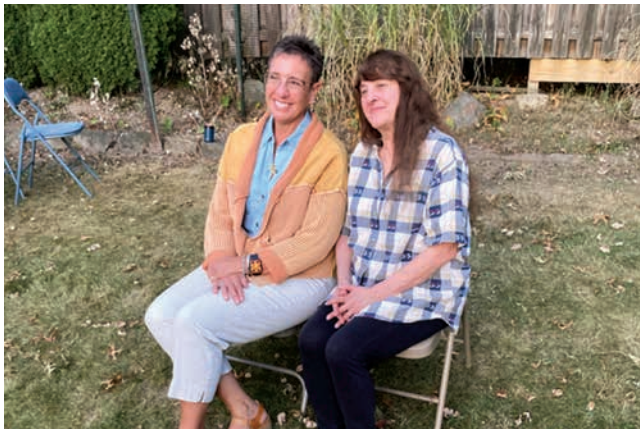
SPS 1973/ Salem High School Class of 1979 – 45th Salem High School Class Reunion