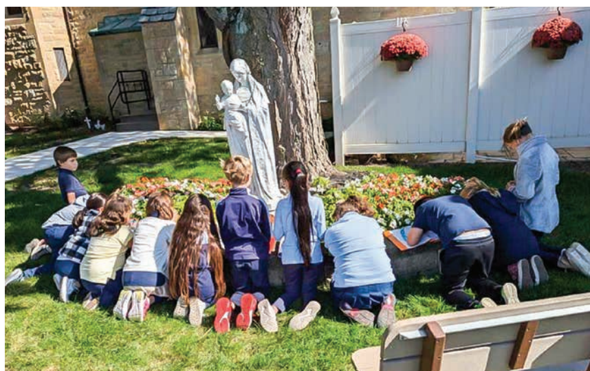
Students regularly gather at the prayer garden to pray the Rosary.

Due to several grants, the school has some exciting new updates. The cafeteria was outfitted with