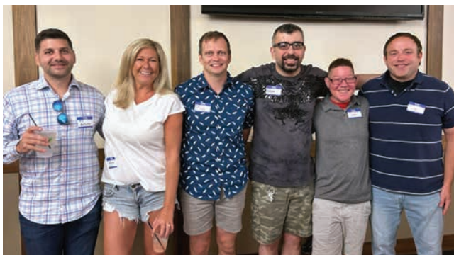
SPS 1998/Salem High School Class of 2004 – 20th Salem High School Class Reunion