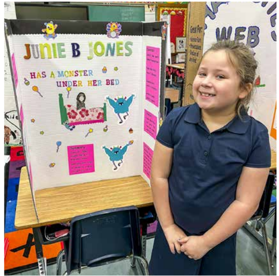
Grades 1-3 hosted a wonderful reading fair where they presented on books they had read, developed tri-fold poster boards, and dioramas.