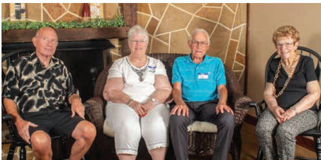
SPS 1955/Salem High School Class of 1959 – 65th Salem High School Class Reunion