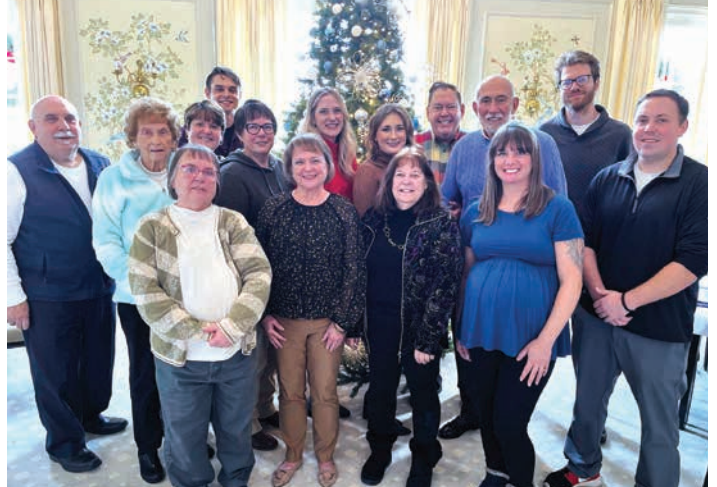
SPS Class of 2003 and Staff – 20th Reunion