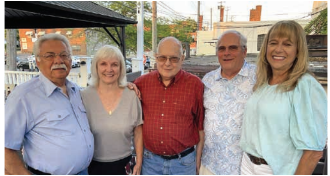
SPS 1963/Salem High School Class of 1967 – 75th Birthday Party