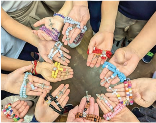
Third graders learn to make their own Rosary and pray in the parish prayer garden.

try new foods and learn about customs, countries, and cultures.