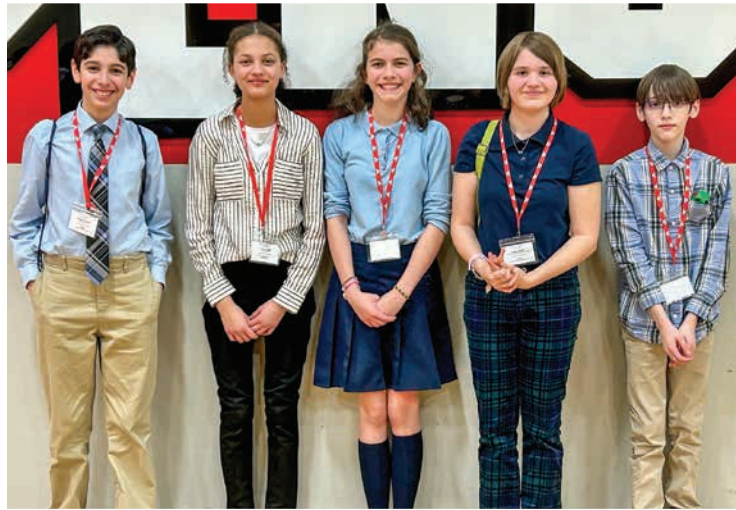
Five St. Paul School students advanced to the District Science Day at Youngstown State University where they won multiple awards and scholarships.